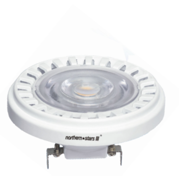
Base Type : GU10